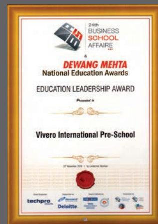
Dewang Mehta Award