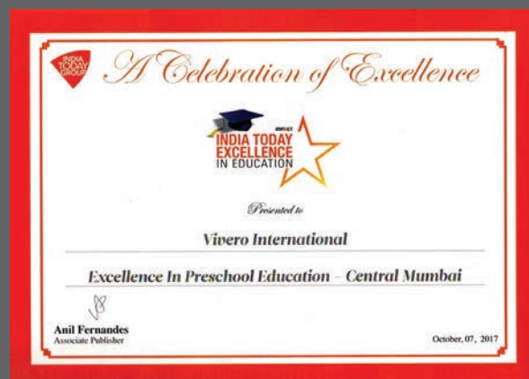
India Today Excellence Award