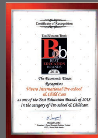
Economic Times Award